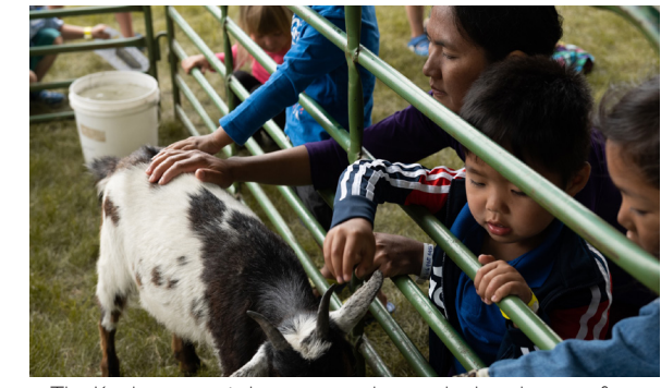
The Kindergarten 1 division joined several other divisions for a petting zoo!