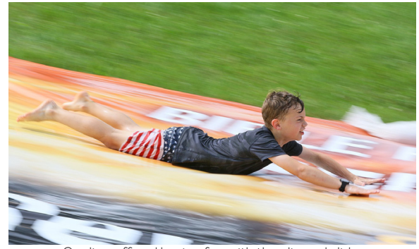
cooling off and having fun with the slip and slide